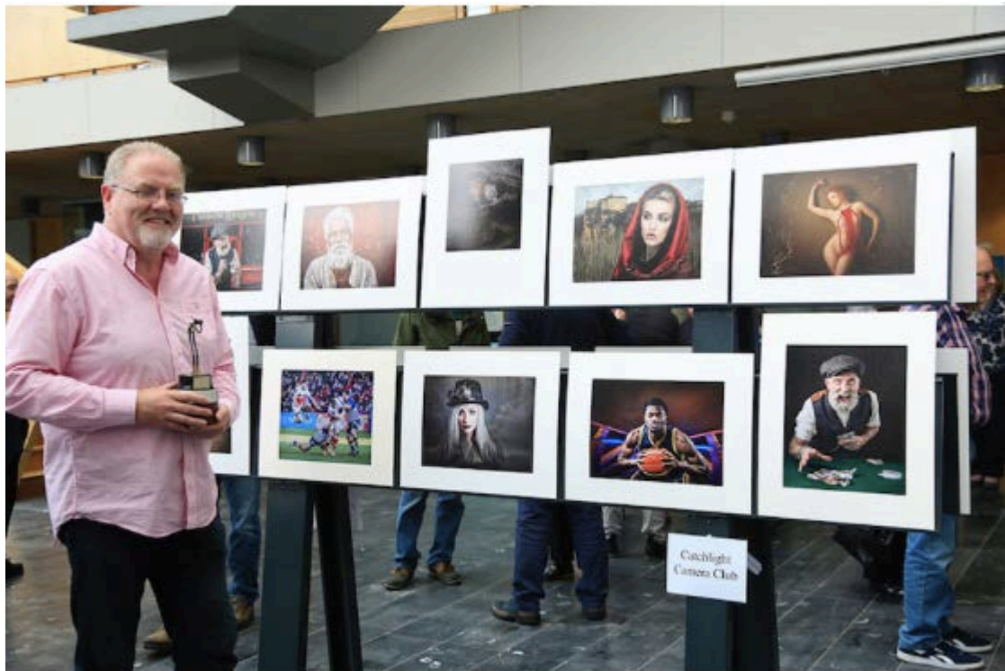
Catchlight Camera Club National Club Championship 2017