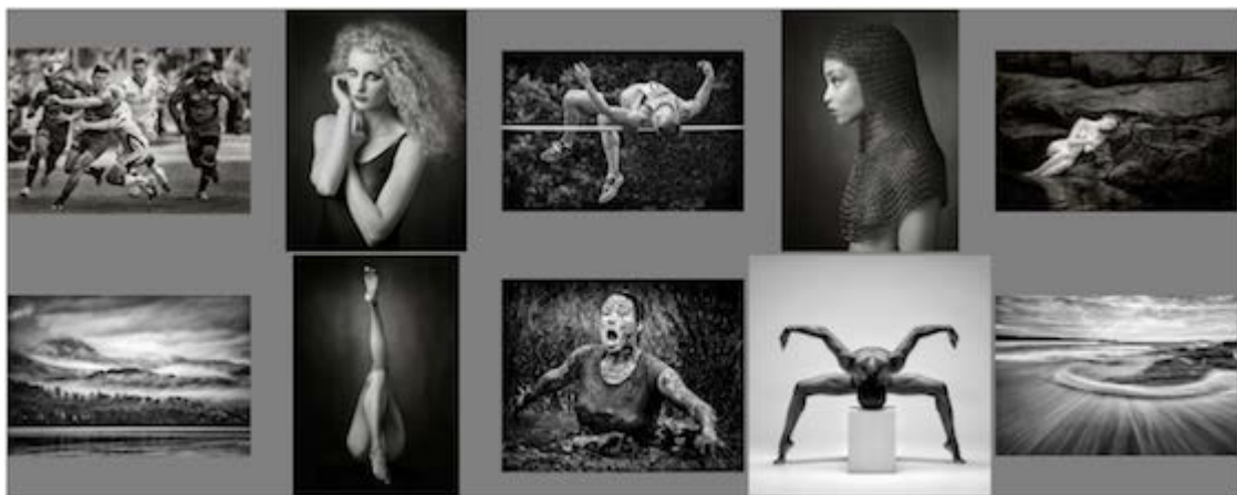
2nd place monochrome print panel - Creative Photo Imaging Club