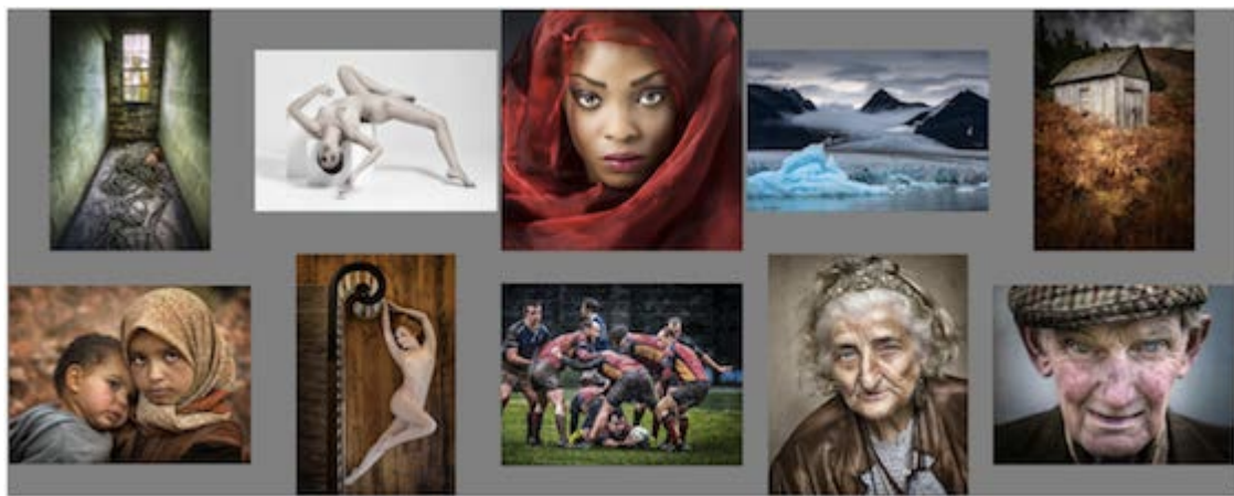
1st place colour print panel - Creative Photo Imaging Club